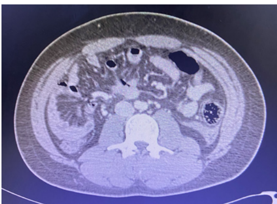
Figure 3: Axial CT images showing small amount of blood in left paracolic gutter.

At laparotomy, 400ml of blood was evacuated from the abdomen and a grade three sigmoid colon injury was identified, with feculent peritonitis (Figure 4). Due to the patient's hemodynamic status and the need for intraoperative inotropic support, a Hartmann's procedure was performed and the patient was taken to the Intensive Care Unit (ICU) for postoperative recov-