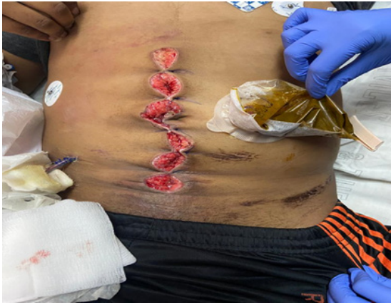
Figure 1: image showing seatbelt sign (taken post-surgery).