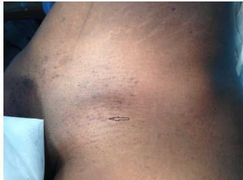
Figure 2: Photograph of the groin- the arrow indicating the position of the left femoral hernia.

After resuscitation, the patient was taken to the OR for emergency exploration of the groin. Under GA and the patient in the supine position entire abdomen and groin was cleaned and draped. A right oblique inguinal incision was made and a 4x4 cm sac of left femoral hernia was noted (Figure 3). A trans-inguinal approach was used for the surgery. The content of the sac was a loop was small bowel and it was noted to be viable (Figure 4). The sac was closed and the hernia was reduced. A Mc Vay Cooper's repair was done with non- absorbable sutures along with on-lay mesh hernioplasty. The patient had an uneventful recovery. At 36 months follow up the patient is doing well, participating in her professional weightlifting without any further complaints.