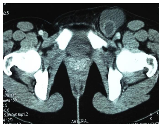
Figure 1: CT scan of abdomen and pelvis with intravenous contrast showing obvious left femoral hernia.

A 27 years old female, professional national weightlifter presented to the Emergency Department with progressively worsening pain in her left groin for the last few weeks. History revealed that the patient had aching pain for the last one year. She claimed that she only feels the pain after the heavyweight lift but denied off any pain with regular weightlifting. The patient visited many GP's and her pain temporary subsided with the use of NSAIDs. The patient had one child and was born by normal vaginal delivery. She had no co-morbid condition and denied any trauma or surgery in the past. Over the last few weeks, the pain worsened and the patient went to a general surgeon. A CT of abdomen and pelvis with intravenous contrast was performed which revealed a left femoral hernia with a partial small bowel obstruction (Figure 1). The patient was then referred to the general hospital for further management. On examination, the patient was mildly tachycardic with a pulse of 110 beats per minute and her mucous membranes were pink but mildly dehydrated. Her abdomen was minimally distended, tympanic with no guarding or rebound tenderness. There was just a barely visible, tender swelling over the left femoral canal (Figure 2). The overlying skin was normal and there was no inguinal lymphadenopathy. The digital rectal examination and per vaginal examination was normal.