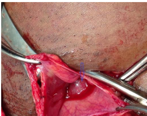
Figure 4: Intraop photograph showing small bowel as the content of the femoral hernia sac.