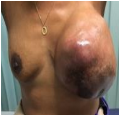
Figure 6: Giant phyllodes tumor

phyllodes tumor, and mastectomy proposed. The patient defaulted from the clinic and returned after 6 months. She revealed that she sought help from alternative medicine, but it did not work for her. On examination of her right breast the mass was 34 x 24 cm with obvious skin induration and peau d'orange (figure 6) however there were no palpable axillary lymph nodes. A needle core biopsy revealed benign phyllodes tumor. CT scan of the chest and abdomen revealed no pulmonary or liver metastases. Subsequently the patient underwent wide mastectomy (figure 7) with immediate latissimus dorsi myocutaneous flap reconstruction (figure 8). The patient had a successful post op recovery (figure 8). Final histology revealed a benign phyllodes tumor with few mitoses and scanty nuclear pleomorphism. At 3 years follow up the patient remains symptom-free and there is no sign of local recurrence or distal metastasis.