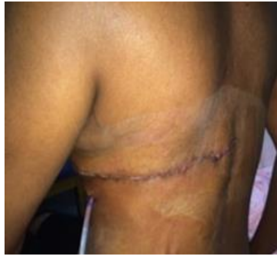
Figure 8: Closure of chest wall defect with LD myocutaneous flap Figure 9: Scar on the back after LD myocutaneous flap removal