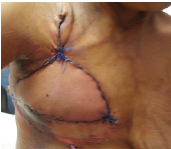
Figure 5: Photograph taken on postop follow up