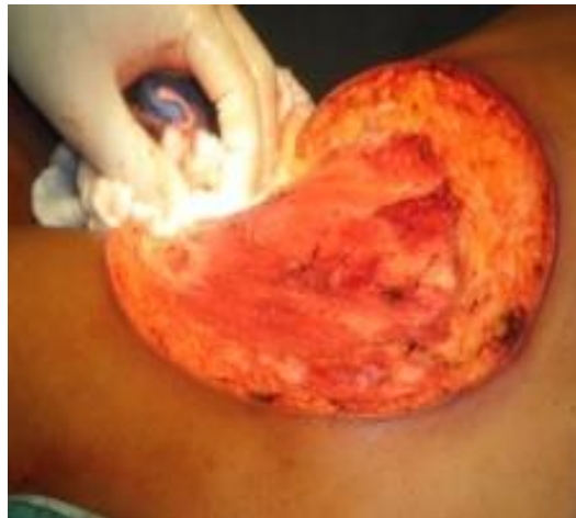
Figure 7: Chest wall after excision of giant phyllodes