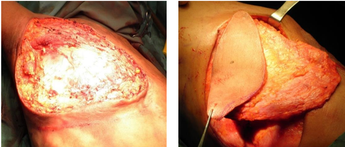
Figure 3: Chest wall after excision of phyllodes tumor; Figure 4: Latissimus Dorsi flap to cover the anterior chest wall