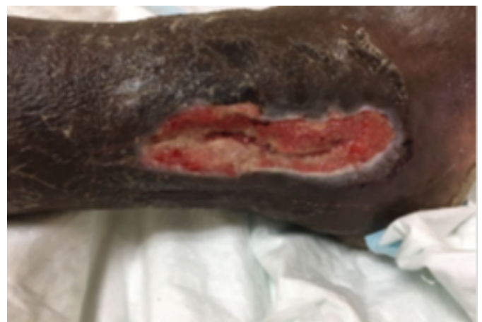
FIGURE 2: Day One Post Removal of Infected Implant with Autologous PRP Dressings

During his 2 week in-patient stay intravenous antibiotics were continued. CRP and wound swabs were repeated every 4 days. Wound swab results noted; No