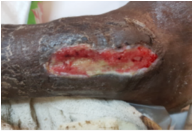
FIGURE 3: Day Three Post Removal of Infected Implant with Autologous PRP Dressing.