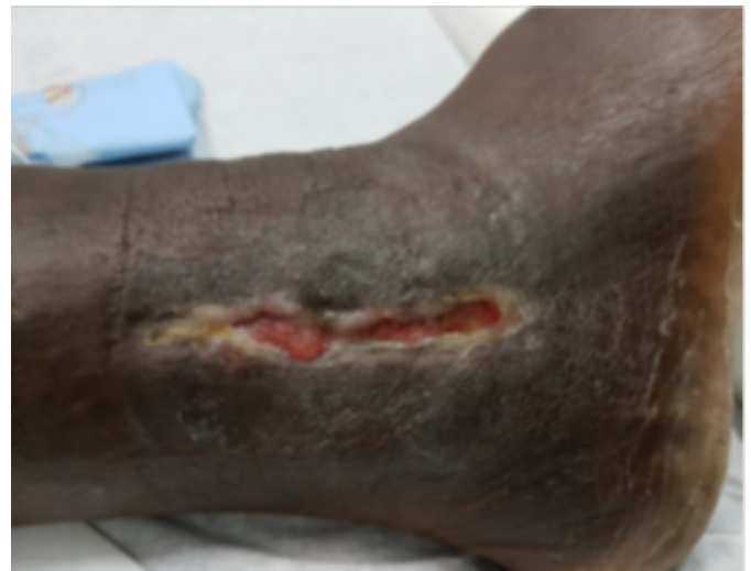
FIGURE 7: Day Thirteen Post Removal of Infected Implant with Autologous PRP Dressings