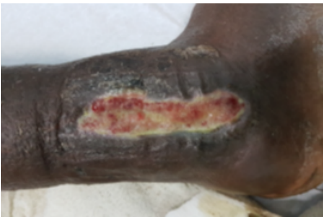
FIGURE 5: Day Seven Post Removal of Infected Implant with Autologous PRP Dressings

Bacterial Growth and CRP and WBC result trends are noted in Graph 1.