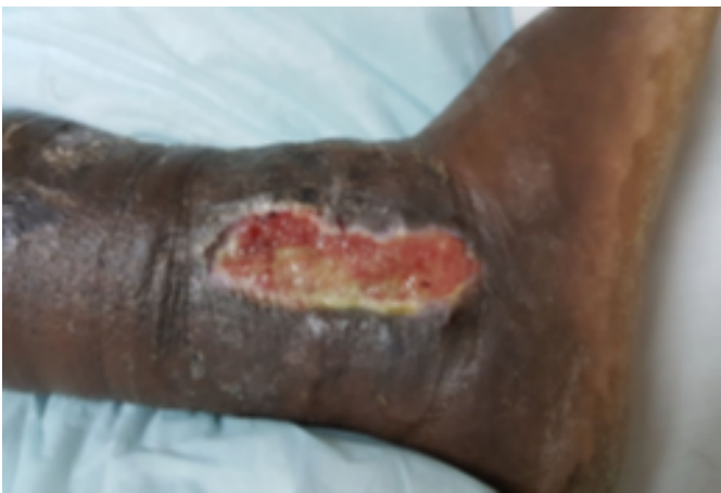
FIGURE 4: Day Five Post Removal of Infected Implant Autologous PRP Dressings