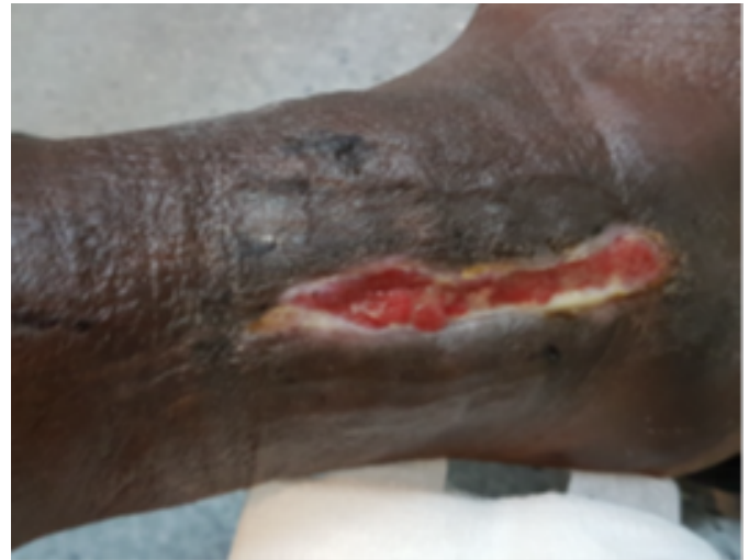
FIGURE 6: Day Eleven Post Removal of Infected Implant with Autologous PRP Dressings