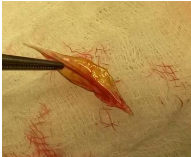
Figure 4: Picture of the fish bone (after removal from the lumen of the ileum)