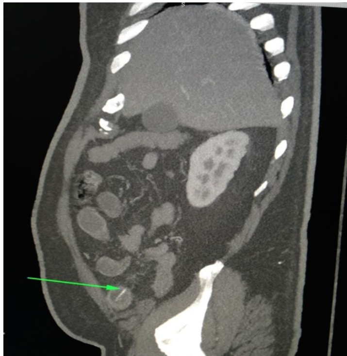
Figure 2: CT scan of abdomen and pelvis showing the presence of a hyper dense lesion within the lumen of the distended ileum