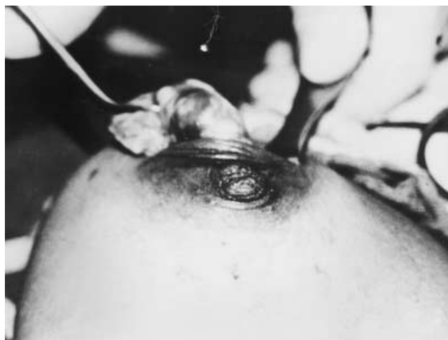
Figure 1. The fibroadenoma was grasped with a towel clip and brought to the wound. It was incised and rotated.

an incision was made down to the lump. The mass was mobilized using the index finger until it was completely free from surrounding breast tissue. The mass was then grasped using a towel clip and pulled up to the skin, and an oblique incision was made into the fibroadenoma (Fig. 1). This incised portion was rotated out of the incision, and the lump was progressively incised and rotated (Fig. 2) until the entire mass was rotated out of the incision in a “Swiss roll”-type fashion (Fig. 3).