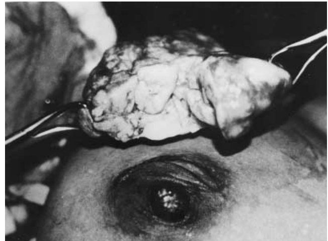
Figure 3. The mass was excised in toto and could be likened to a Swiss roll.

Although some authors believe that circumareolar incisions could lead to extensive duct damage, careful planning of the incision could minimize this risk (5).