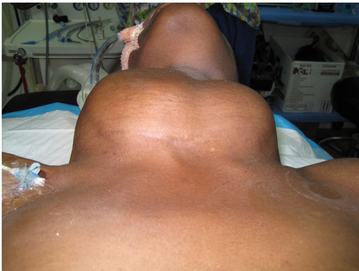
Figure 1 Large benign multi-nodular goiter. The figure illustrates the size of the large multi-nodular goiter that our patient presented with. This goiter measured 14×11 cm (right lobe) and 11×8 cm (left lobe). No retrosternal goiter was found on examination. Our patient was intubated and on the ventilator with a central line in place on the right.

compressed (Figure 3). The results of an electrocardiogram (ECG) were normal, while the results of an echocardiogram were consistent with hypertensive heart disease with an ejection fraction of 65%.